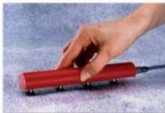
WENNER-PROCEQ Resistance probe