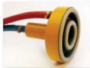
Two-chamber vacuum cell with sealing rings