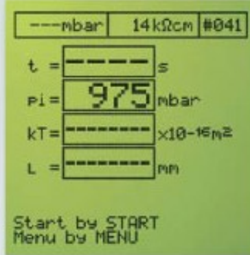
Display before start of the measurement.